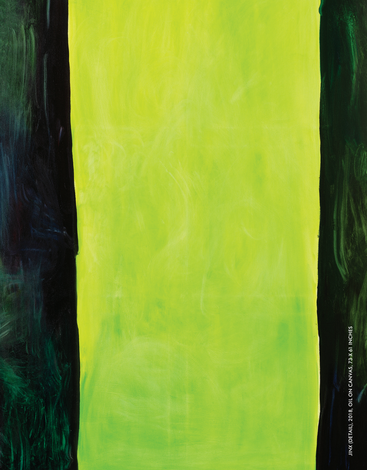
JINX (DETAIL), 2018, OIL ON CANVAS, 73 X 61 INCHES