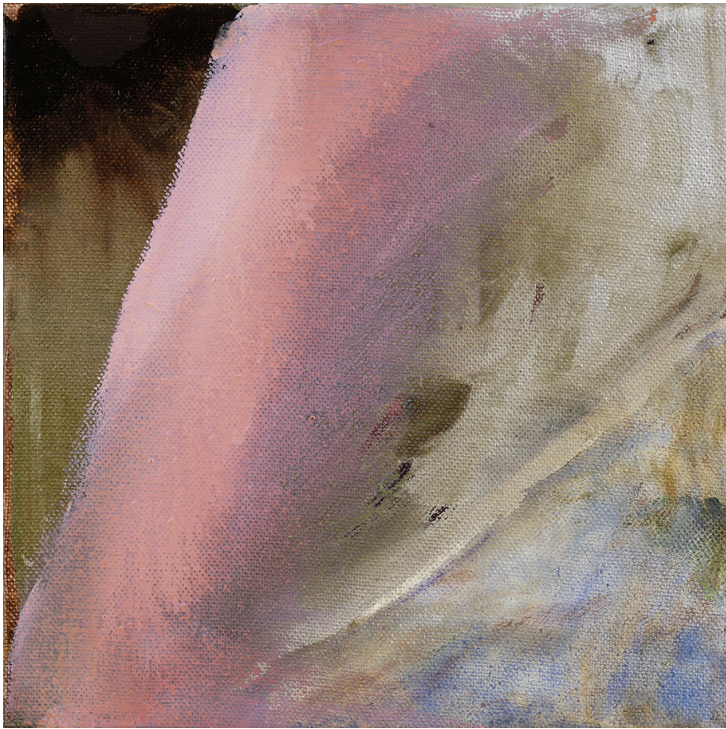
THE PINK LIGHT #a, 2019, OIL ON CANVAS, 8 X 8 INCHES