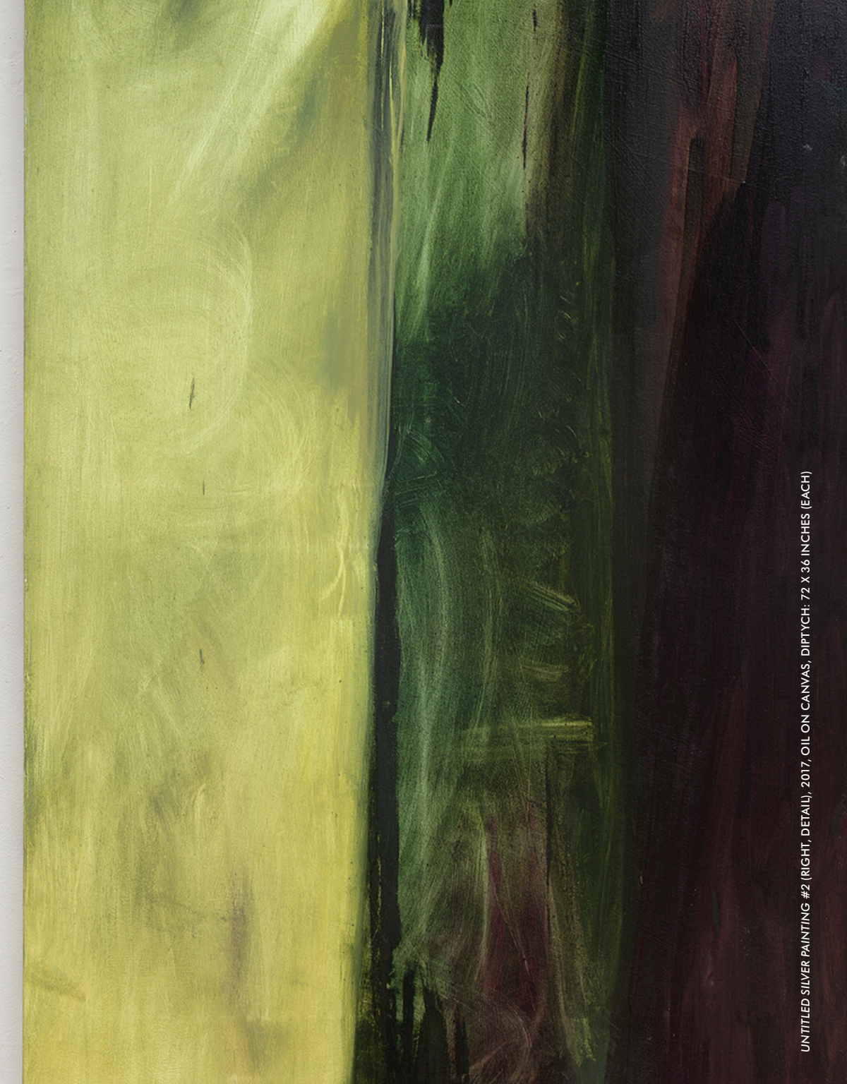
UNTITLED SILVER PAINTING #2 (RIGHT, DETAIL), 2017, OIL ON CANVAS, DIPTYCH: 72 X 36 INCHES (EACH)