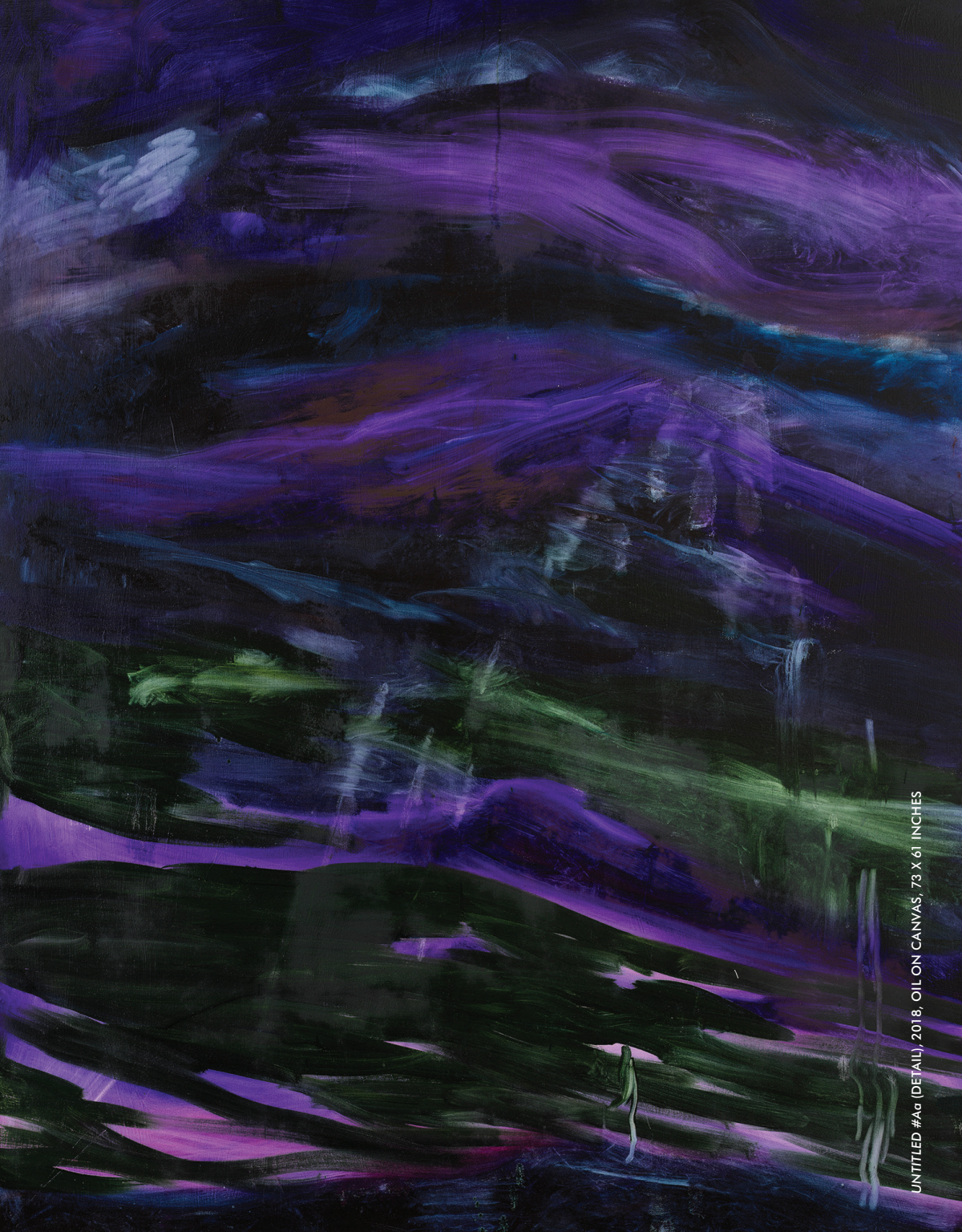
UNTITLED #A9 (DETAIL), 2018, OIL ON CANVAS, 73 X 61 INCHES